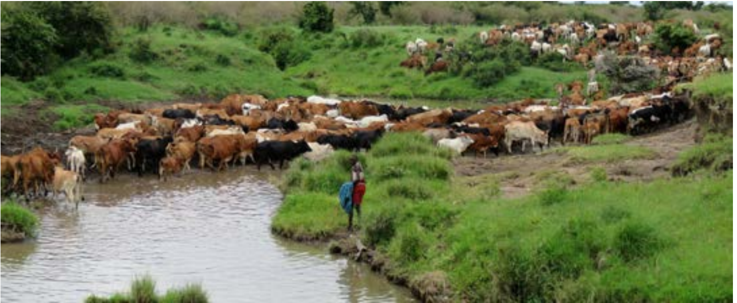
Cattle in Kenya's Maasi Mara Reserve.

The Serengeti ecosystem is under threat, primarily due to pressures from people and climate: