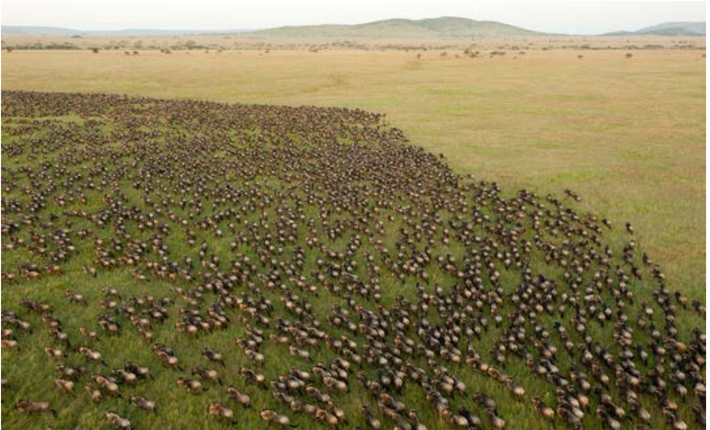
Wildebeest migration..

Home to the largest terrestrial migration on earth, Serengeti means “endless plains” in the Maasai language. But that is far from the case now. The Serengeti is an island in a sea of people. Both the ecosystem and local communities are facing growing impacts.